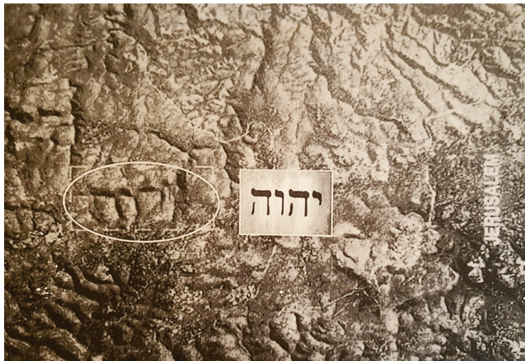
Bible Archaeology Digest

“But go now to My place which was in Shiloh , where I set My name at the first, and see what I did to it because of the wickedness of My Israel.” Jer 7:12 (NKJV)